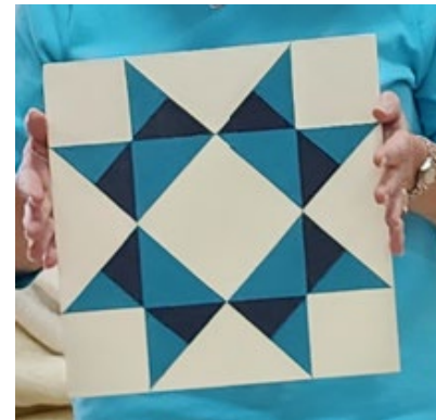
Edith Page's Barn Quilt block